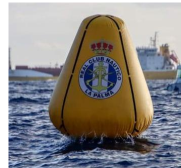
Finish line Finish buoy

17.2 Forms to request hearing will be at the Race Office in Santa Cruz.